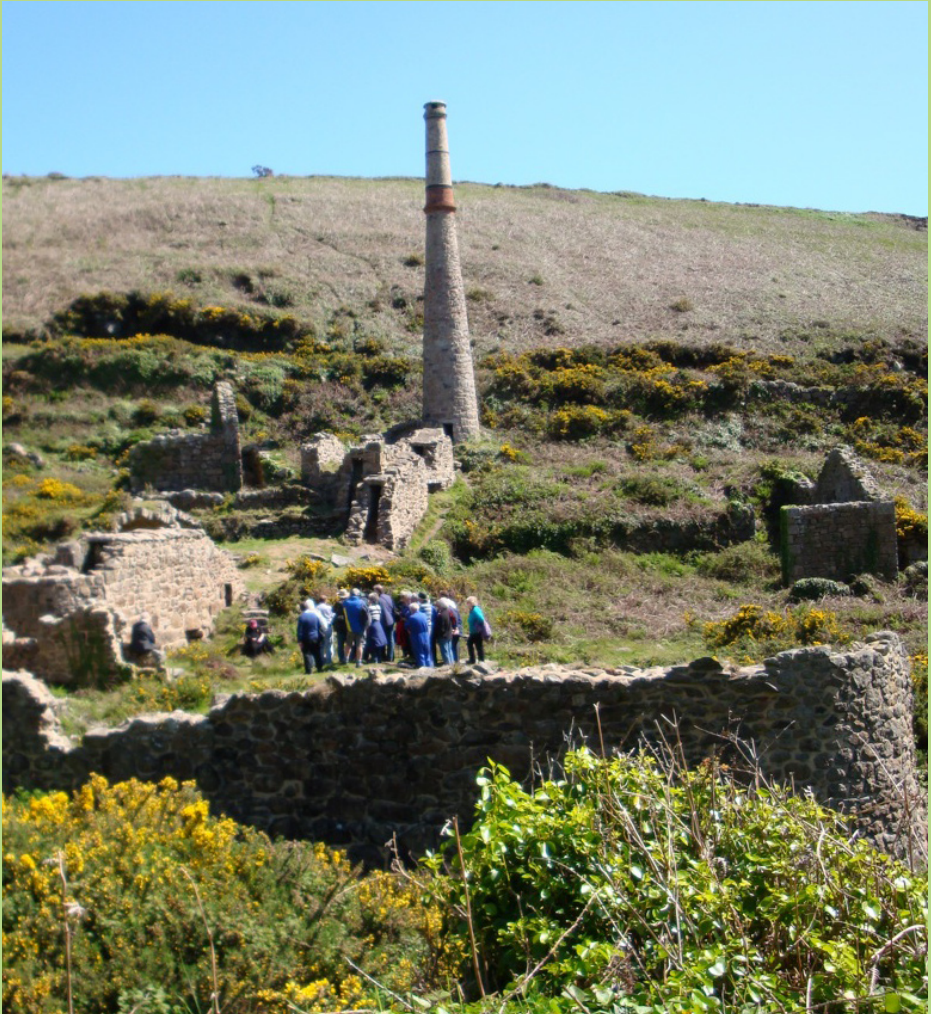
AGM weekend: members enjoying a tour of the arsenic works in the Kenidjack valley.

KOWETHAS TREVITHICK NEWSLETTER 156 SUMMER 2012