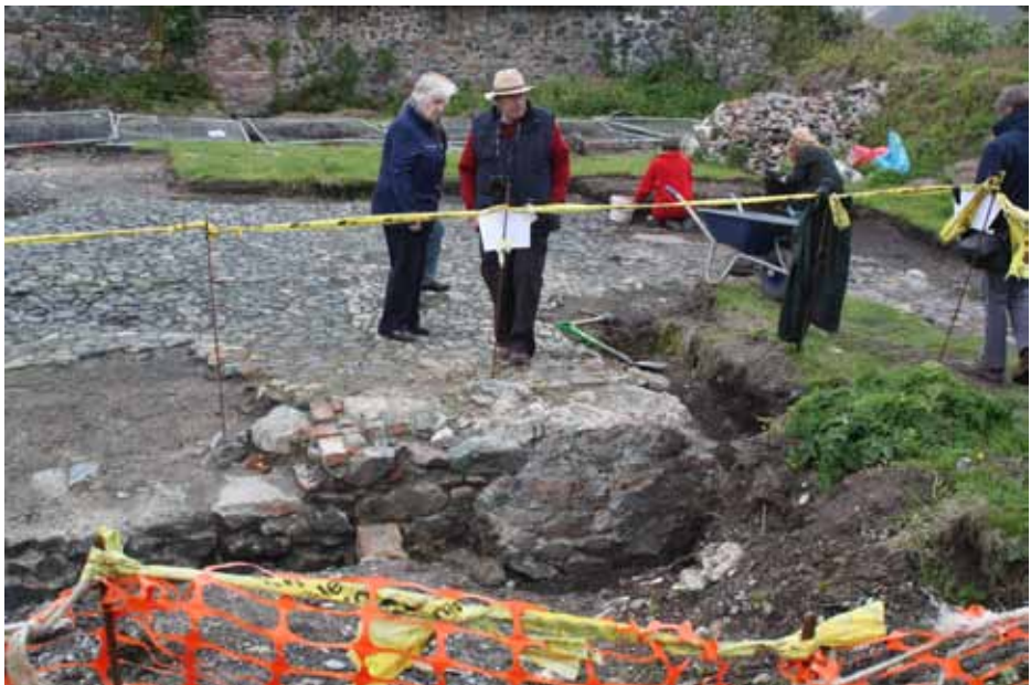
Real industrial archaeology at King Edward Mine