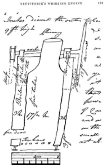
Fig. 86. Trevithick's whirling engine, 1815. From the Engine Papers.