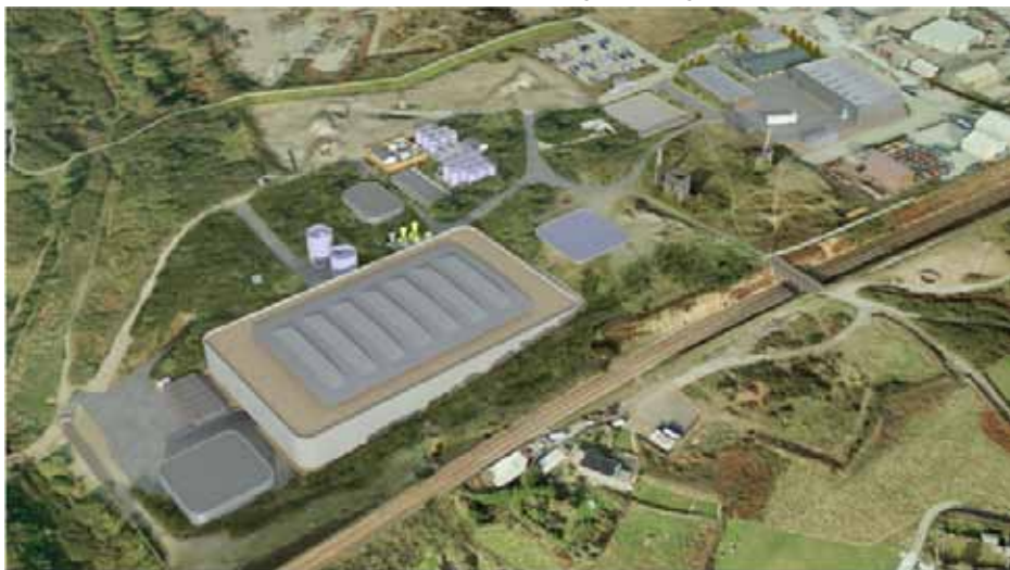
An artist's impression of the new mine from the air.